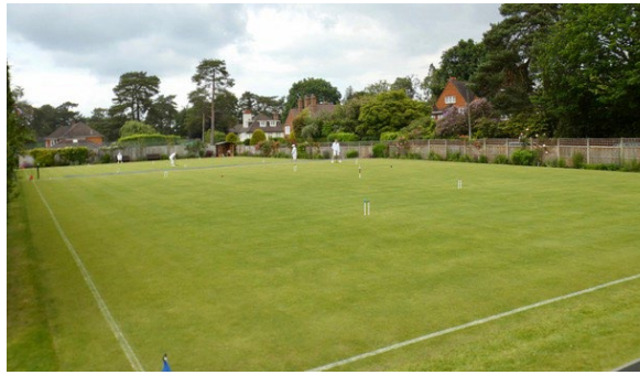
Woking Croquet Club