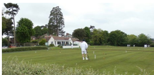
Ryde Croquet Club