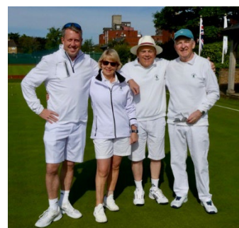
Roehampton Club Team

Our second-round match on 6th June was played away against Woking with the same team. A strong display in the morning saw us lead at lunchtime 2-1, however Woking rallied and won the match by 4-3 despite our best efforts.