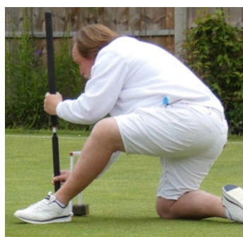
A Woking player with a tricky shot