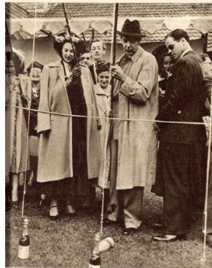
JUNE 29.—O the wind and the rain at Roehampton Club! Occasion the Theatrical Garden Party. Host: Noel Coward in grey top-hat and accessories. He's playing skittles in my picture with Margaret Lockwood. Raymond Massey in picture on left tried to hook champagne bottle; with him was his wife. Actresses had had dresses specially built for this event, and were in fimsiest of fragile chiffons.

Cocktail Reception in London hosted by Sir Lawrence and Lady Olivier for the 1949 Theatrical Garden Party at Roehampton Club – The Sphere publication photograph and accompanying report of the event.