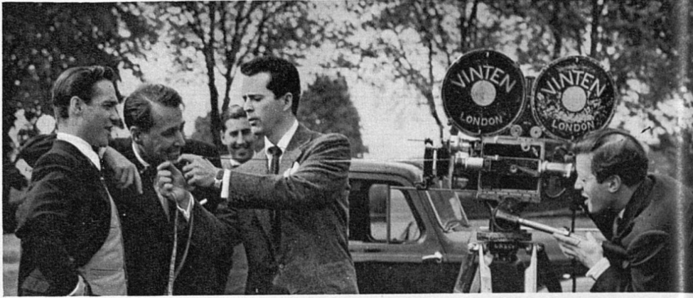
On the set both ways you look at it: Richard Attenborough, Larry Parks, give a film test to Richard Todd.