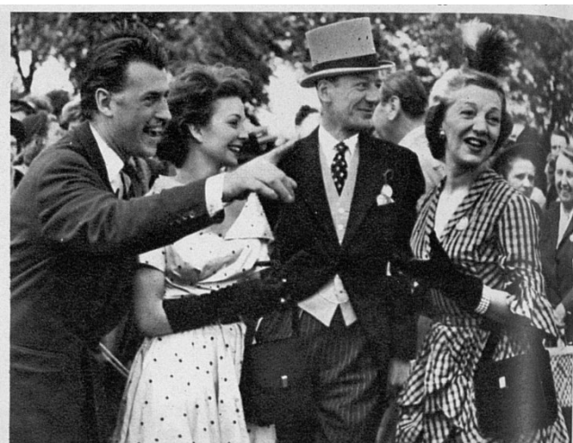
2. GAY QUARTETTE : Stewart Granger and Jean Simmons, with the hosts, John Gielgud and Gertrude Lawrence, at the Theatrical Garden Party

THE OLIVIERS HOLD COURT AND AN AUCTION : Eighteen Ambassadors, ten Ministers and Chargé d'Affaires and more than 300 stage and screen celebrities, thronged No. 96 Piccadilly, last week, at a cocktail party and reception in connection with the annual Theatrical Garden Party to be held in May in the grounds of the Roehampton Club in aid of the Actors' Orphanage. The principal event was an auction, with film-star Richard Attenborough acting as auctioneer. It was in 1943 that he scored his great success in the play, Brighton Rock . Film-star Anne Crawford, who appears in the above picture with the Oliviers, was noted as one of the best-dressed women of the evening in a dress of silver-grey slipper satin. Miss Crawford is another outstanding Gainsborough player and appeared in "Millions Like Us."