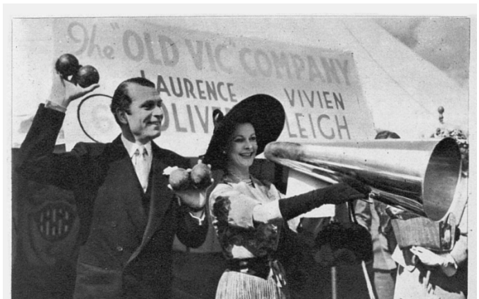
ROLL UP! ROLL UP! Sir Lawrence and Lady Olivier (Vivien Leigh) attracting custom at the Old Vic sideshow at the recent Theatrical Garden Party, Roehampton