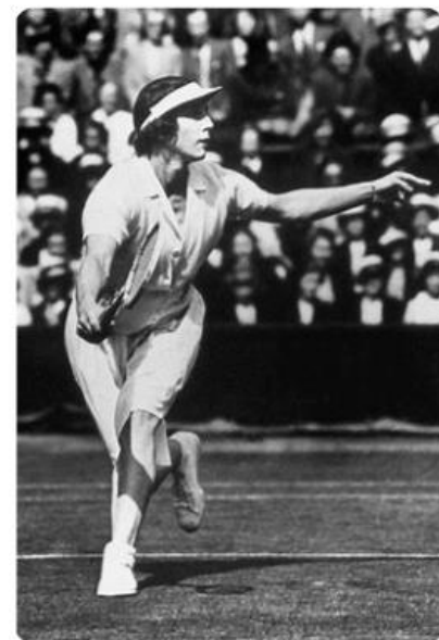
Helen Willis Moody, Paris 1924 |