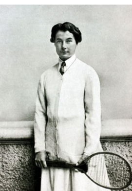
Ethel Thomson Larcombe