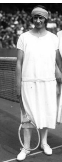
Kathleen 'Kitty' McKane