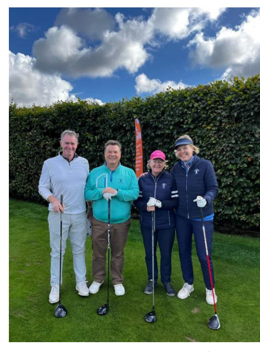
Past and Present Captains after the Drive in

There are two big mentions here. First to the Annodata squad who are now in the quarter final . The surprise news is that the next match will be held Away against Perrenporth – in Cornwall! Hats off to the ladies who are racing down to the South West this coming weekend determined to bring home that win.