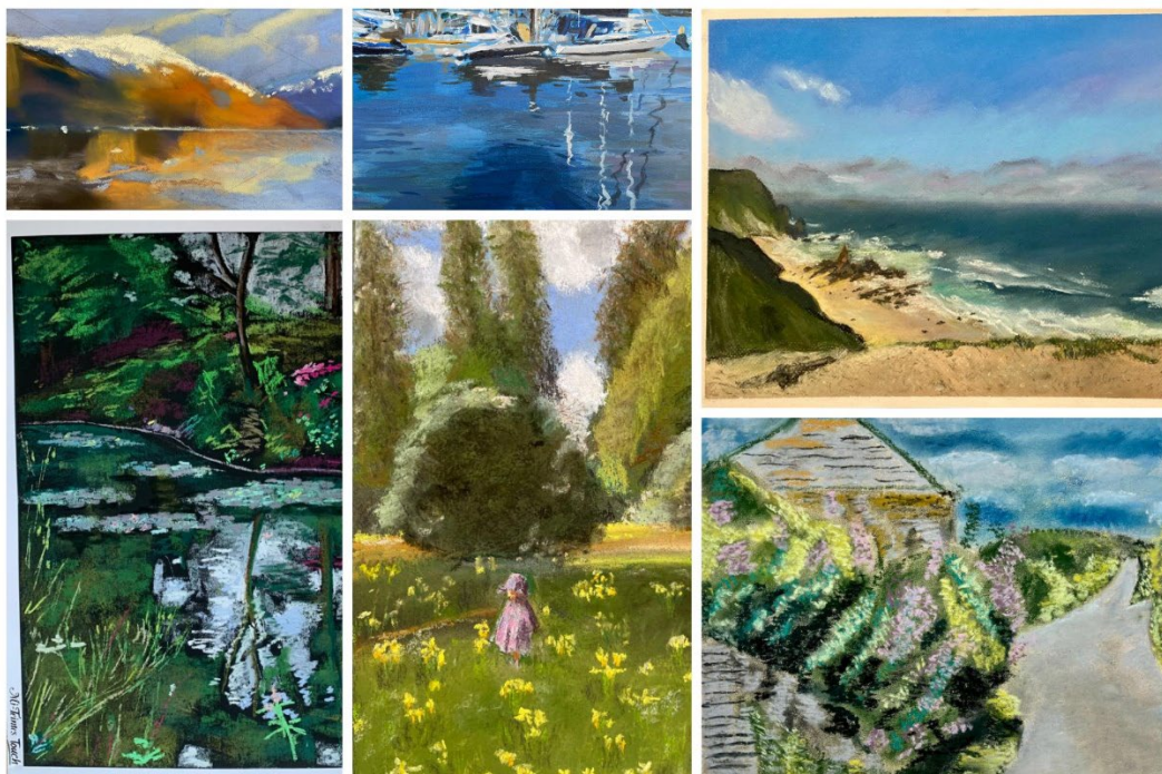
Summer student artwork