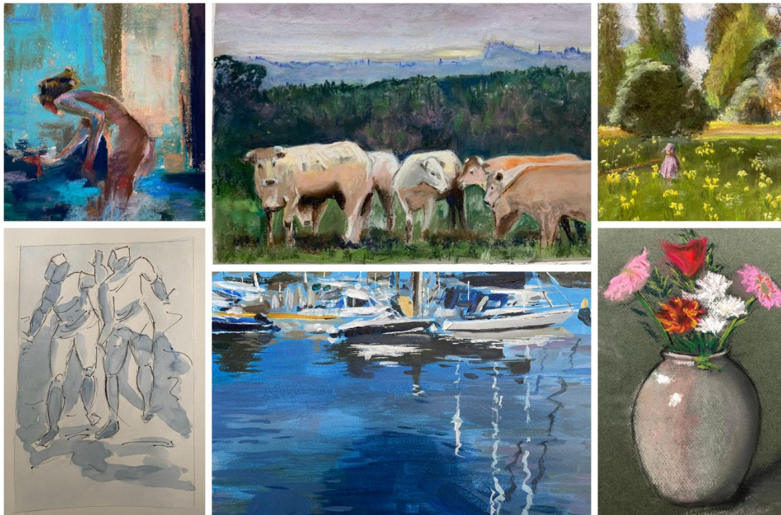
Artwork from summer classes