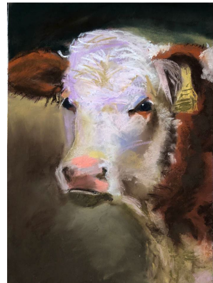
Young bull in the pastels class