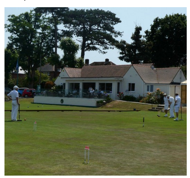
One means of transport (left), Ryde Lawn Tennis and Croquet Club (right)